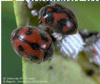
UC Statewide IPM Project