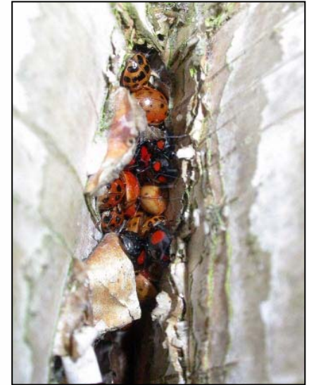
Aggregate on birch/Birke, feb. 2004 R'dam