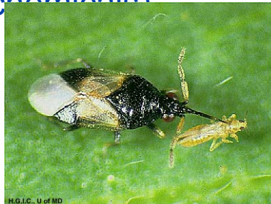
H.G.I.C. U of MD