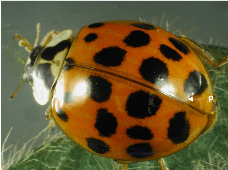
Adult Harmonia axyridis , red variety; p = plica elytrac